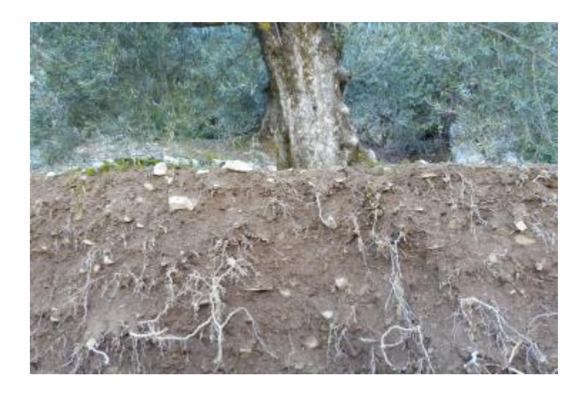
Address El Cornetal, Torres, Jaén