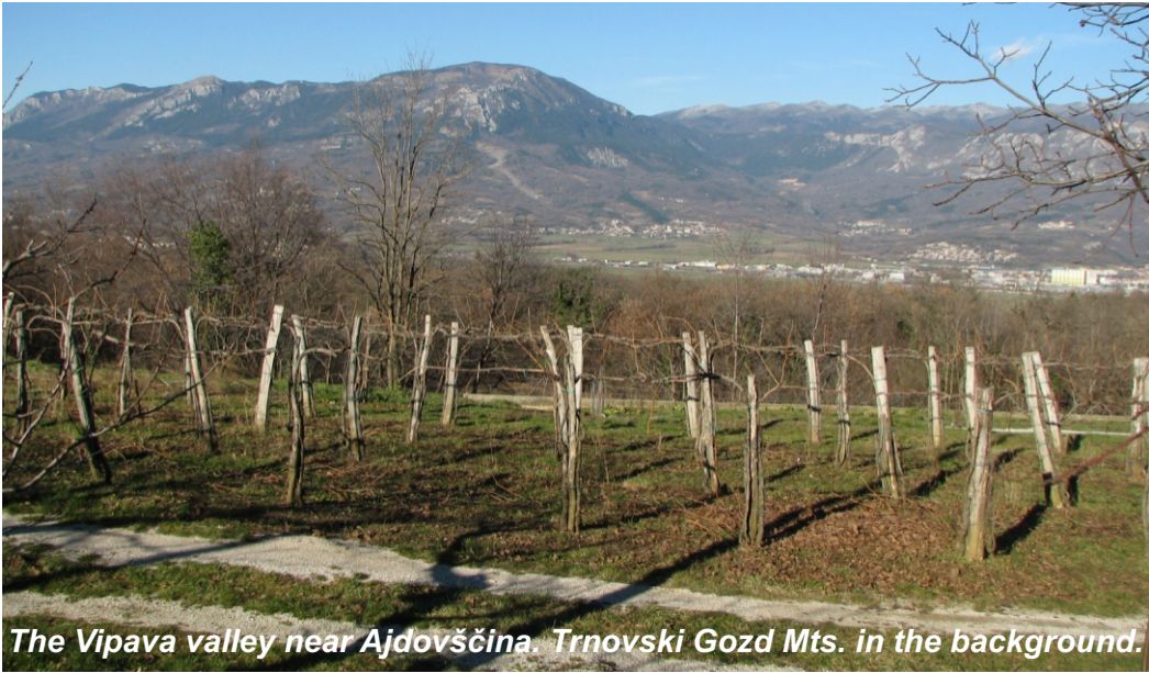
The Vipava valley near Ajdovščina. Trnovski Gozd Mts. in the background.